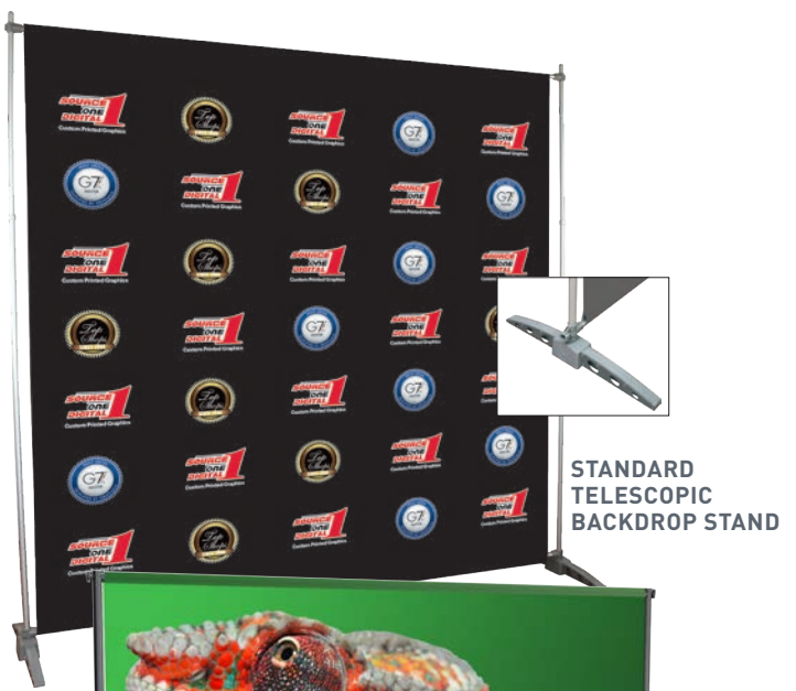
STANDARD TELESCOPIC BACKDROP STAND