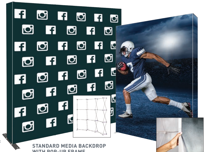
STANDARD MEDIA BACKDROP WITH POP-UP FRAME