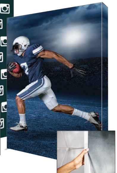
DELUXE MEDIA BACKDROP WITH EXPANDABLE FRAME