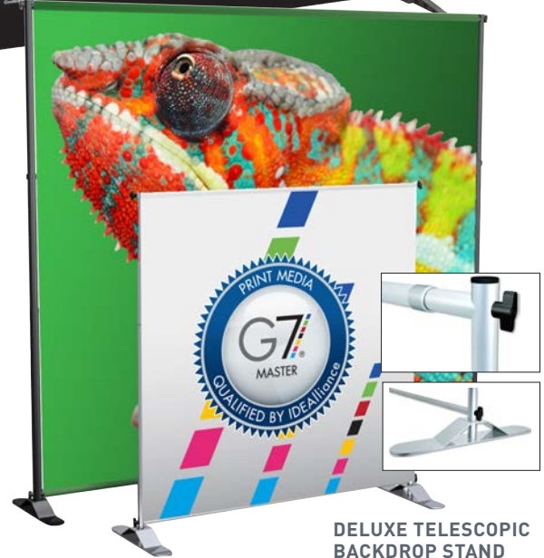
DELUXE TELESCOPIC BACKDROP STAND