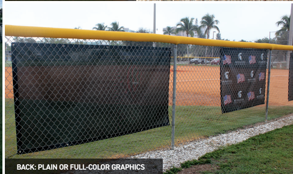
BACK: PLAIN OR FULL-COLOR GRAPHICS

For additional branding, promotional and sponsorship opportunities, turn to Impact Mesh 360™. Impact Mesh 360™ turns fences and other areas into large outdoor graphics that make a statement to customers, fans and your community. Impact Mesh 360™ breaks the “normal” mesh barrier with full color, two-sided graphics that doesn’t allow the image from the other side to bleed through. This allows you to print on both sides of the banner without hanging banners back to back or sewing banners together to get a high-quality image on each side.