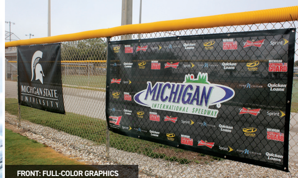
FRONT: FULL-COLOR GRAPHICS