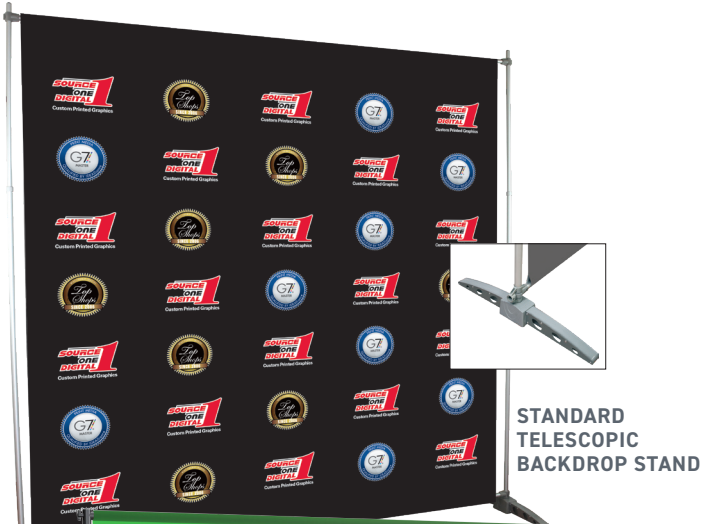
STANDARD TELESCOPIC BACKDROP STAND