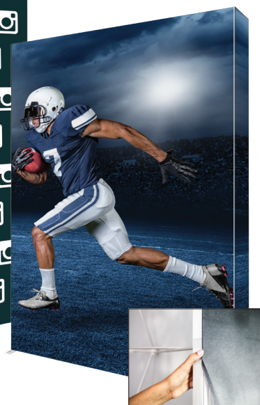
DELUXE MEDIA BACKDROP WITH EXPANDABLE FRAME