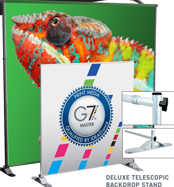
DELUXE TELESCOPIC BACKDROP STAND